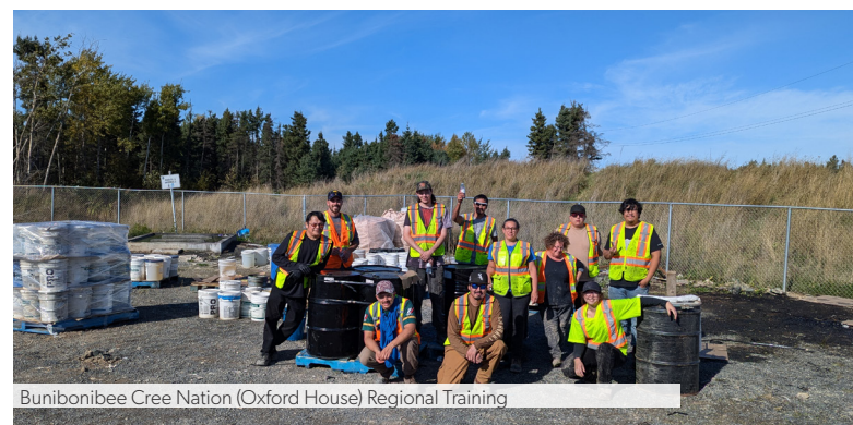
Bunibonibee Cree Nation (Oxford House) Regional Training