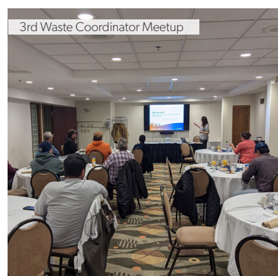
3rd Waste Coordinator Meetup

"I loved it, got a lot of insight on how waste management should work."