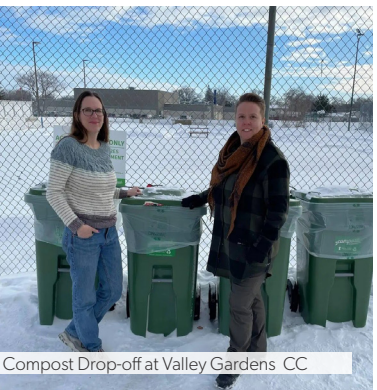
Compost Drop-off at Valley Gardens CC