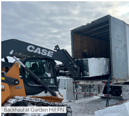
Backhaul at Garden Hill FN