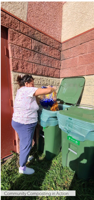
Community Composting in Action