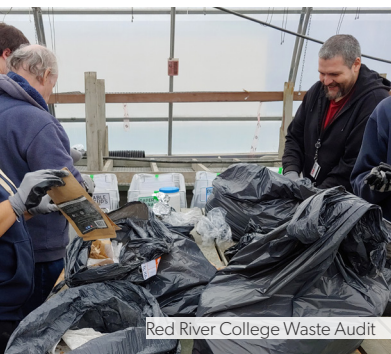
Red River College Waste Audit