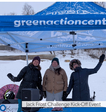
Jack Frost Challenge Kick-Off Event