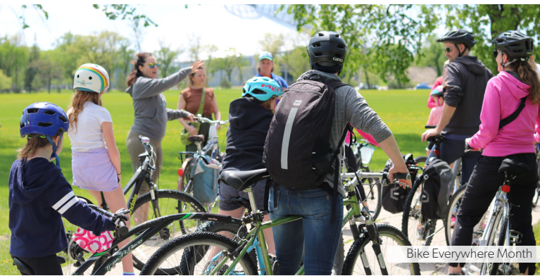
Bike Everywhere Month