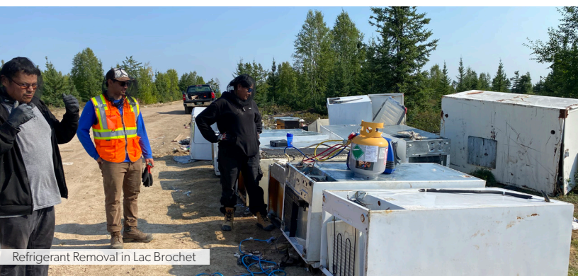
Refrigerant Removal in Lac Brochet