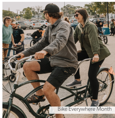
Bike Everywhere Month