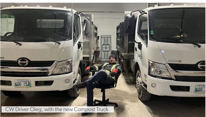
CW Driver Oleg, with the new Compost Truck

"The composting program at GlenwoodCC has been amazing! Our community immediately started supporting the program and dropping off food waste . We've been averaging four full bins a week and sometimes more! Compost Winnipeg has done a great job with the execution and support of the program. They made the program so easy to manage, and there is little to no work for the host location. So proud of our community! When we all work together the difference we make is so much better." - Coralie Charbonneau, General Manager , Glenwood Community Centre