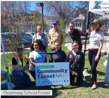
Greenway School Forest