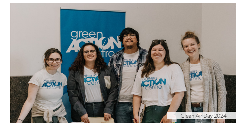
Clean Air Day 2024