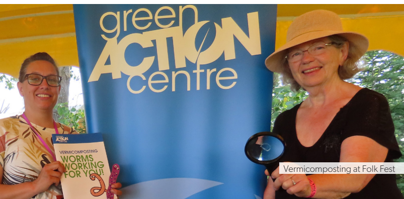
Vermicomposting at Folk Fest