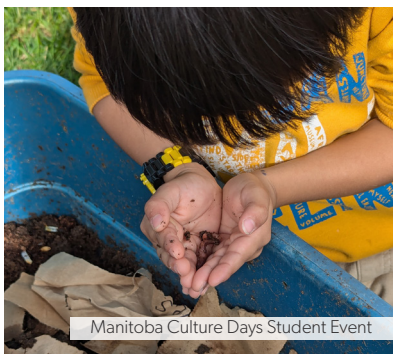
Manitoba Culture Days Student Event