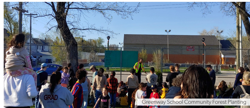
Greenway School Community Forest Planting