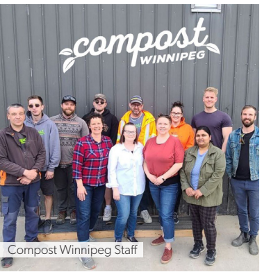
Compost Winnipeg Staff

Total CO2e avoided to date: 7,240,950 kg