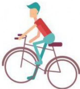
Use the bike(s)