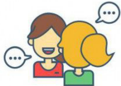
Spread the word