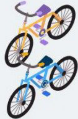
Buy some bikes